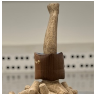
Water Wing , 2022. OSB, walnut, brass.