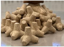
Tetrapods , 2022. OSB