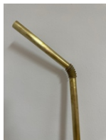
Slurp , 2022. Brass, wood. 30cm.